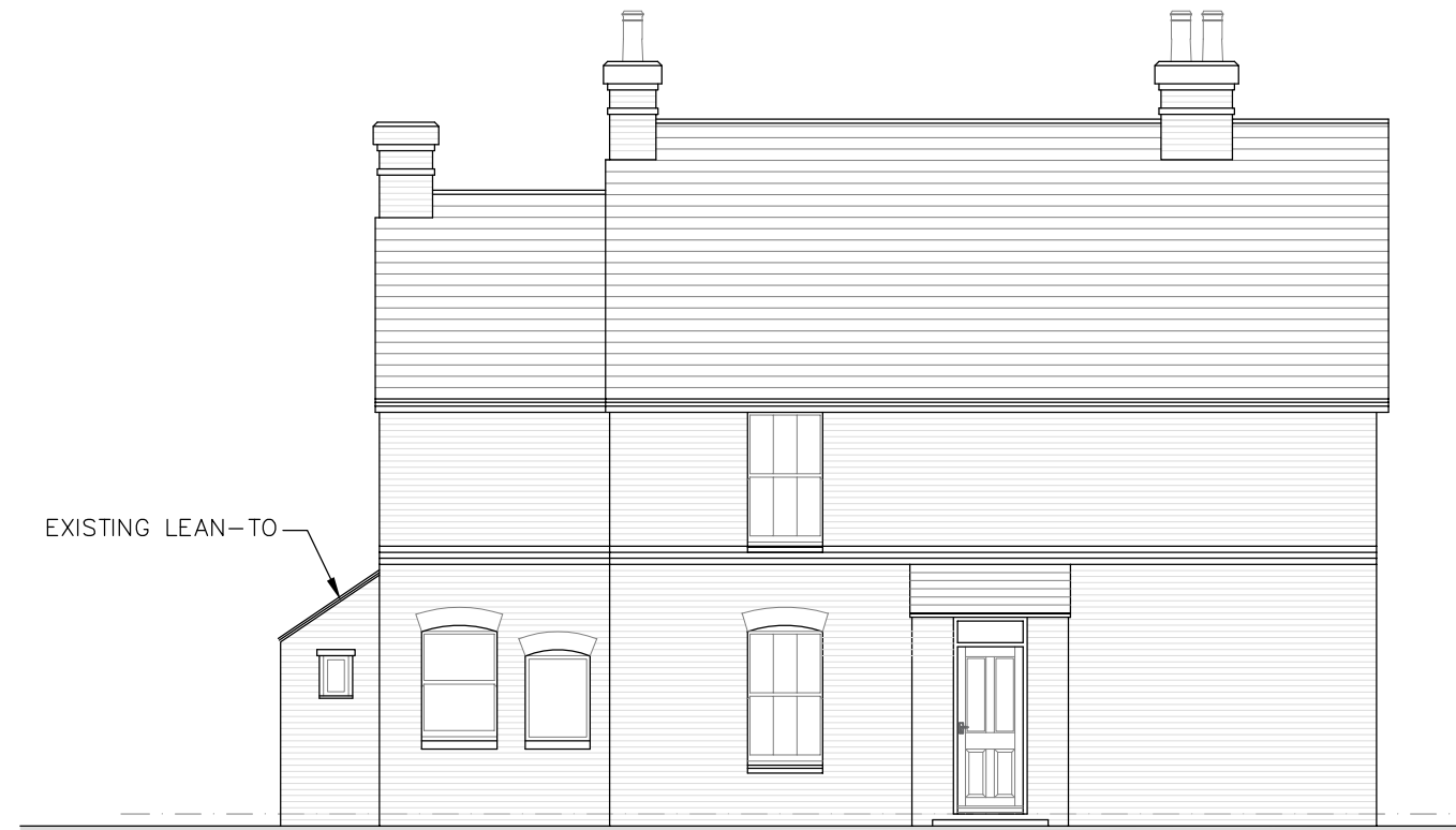
REAR LEAN-TO NORTH (SIDE) ELEVATION AS EXISTING